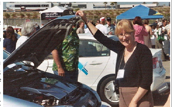
EAD participated in the ride and drive at the Santa Monica Alternative Car & Transportation Expo.

Santa Monica, California - On October 19 and 20, 2007, the Southern California Association of Government (SCAG) and the City of Los Angeles Clean Cities Coalitions partnered to provide an alternative fuel vehicle information booth at the Santa Monica Alternative Car and Transportation Expo. The booth was staffed by the SCAG coalition, where alternative fuel literature was distributed on behalf of many local coalitions, i.e., City of LA, SCAG, City of Long Beach, Western Riverside Council of Governments (WRCOG) and San Diego. The City of LA and the City of Santa Monica also participated in the ride and drive at this event by offering rides in their Honda FCX hydrogen fuel cell vehicles to interested event goers. Daimler F-Cell (hydrogen fuel cell) demonstration vehicles, operated by the Los Angeles World Airports and UCLA were on display and participated in the ride and drive. Approximately 11,000 people were in attendance at this very popular event, now in its second year.