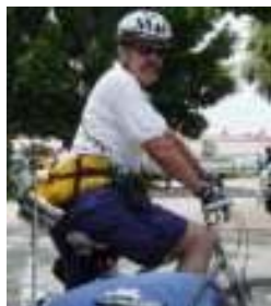
Appreciate the Los Angeles River while you ride in the 5th Annual Los Angeles River Ride, Sunday, May 15th.

To recognize first time and current bicycle commuters connecting to Metro Bus or Metro Rail, bike commuters may board with their bicycle safety helmet and/or bike on Thursday, May 19th, and ride for free. Restrictions apply on some Metro Rail lines for bike commuters. Check with Metro at www.metro.net/biketowork , or call (213)922-2811 for details.