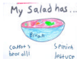
Students create different salads to meet "5-A-Day" requirements