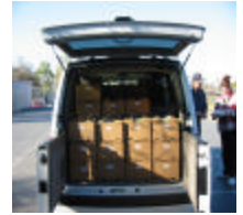
Tierra Miguel boxes arrive at Broadeus Elementary School

Situated near San Diego in one of Fallbrook's quiet green valleys, the 87-acre Tierra Miguel Foundation farm has grown and transported organic vegetables and fruits to Los Angeles and San Diego county residents for three years. In the next few months, as the Tierra Miguel staff ready the farm's van for its weekly deliveries to Los Angeles, sixty boxes containing their fresh produce will be added for LAUSD classrooms in a partnership effort that is targeting K-12 th graders learning about nutrition, food sources, and healthy environments.