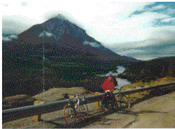
A stop in front of Mt. Sanford along the Copper River.

EAD's own Christopher Patton ventured into the less-than-hospitable climate of Alaska to complete the grueling AIDS Vaccine Ride this past summer. Over a period of six days, Christopher bicycled nearly 500 miles from Fairbanks to Anchorage—through rain, snow, cold, and wind in what he describes as “vast, stunningly beautiful landscape.” He trained