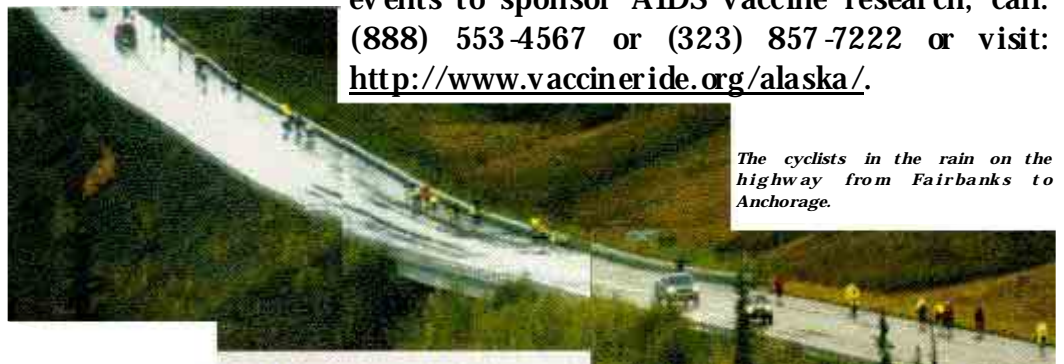
The cyclists in the rain on the highway from Fairbanks to Anchorage.

To find out more about the AIDS Vaccine Ride in Alaska or other cycling events to sponsor AIDS vaccine research, call: (888) 553-4567 or (323) 857-7222 or visit: http://www.vaccineride.org/alaska/ .